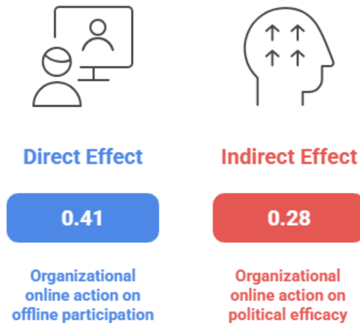
Figure 2 Networked Organizer’s Offline Participation

The difference between the “Engaged Expressor” and the “Networked Organizer” is explained by the mediation analysis (Objective 2). A Structural Equation Model (SEM) was tested to analyze the mechanisms driving these profiles. The model, which achieved excellent fit (CFI = .98, RMSEA = .03), confirmed that the pathway from “Expressive” action to “Offline” action was weak and non-significant unless it was mediated by “Political Efficacy.” The “Engaged Expressor” profile shows high “Expressive” action but fails to build “Efficacy,” resulting in no offline action.