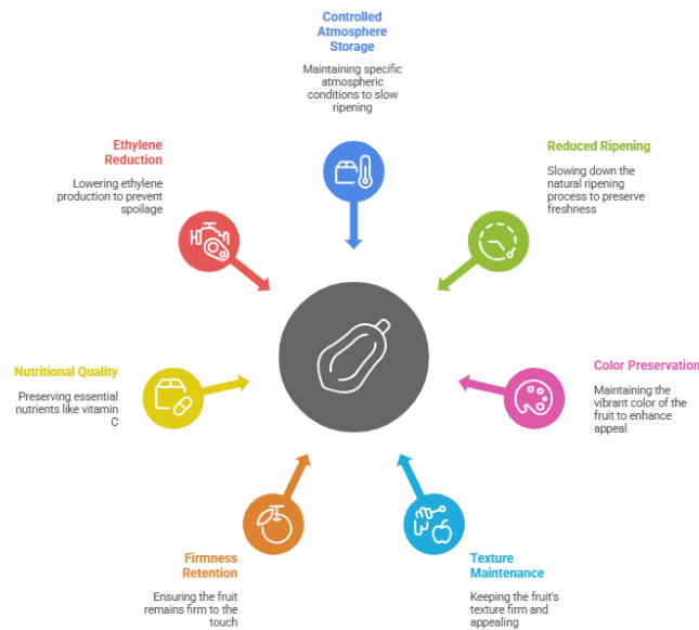
Figure 2. Factors Contributing to Mangosteen Shelf Life Extension

including reduced spoilage and improved marketability (Kaynarca et al., 2024). The findings suggest that CA storage can play a vital role in enhancing post-harvest practices for tropical fruits, especially in export markets where quality and consistency are essential.